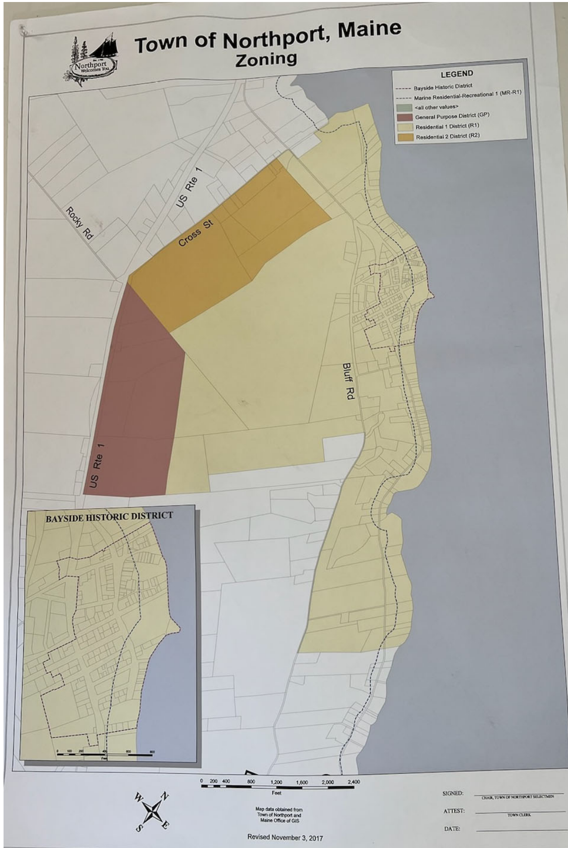
EXHIBIT A Zoning Map of the Northport Village Corporation